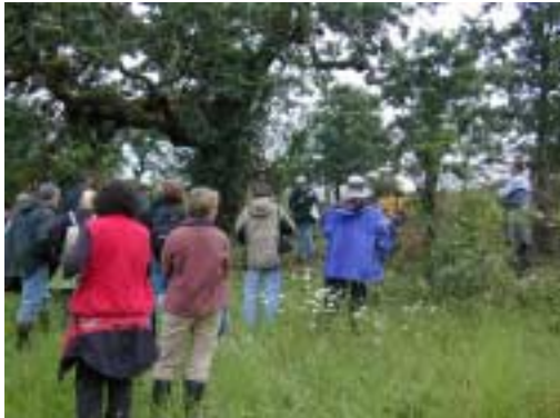
2004 - Tour pre-restoration work