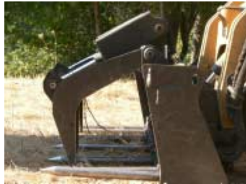
CAT grapple fork attachment