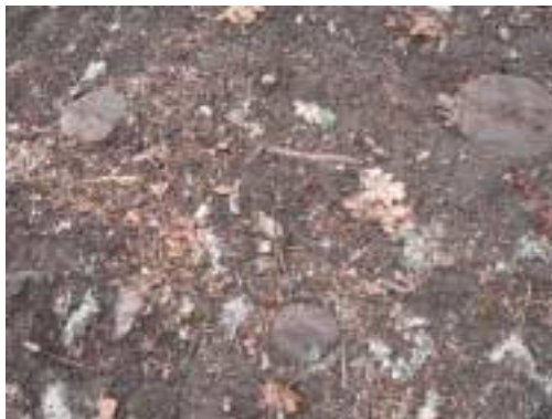
Sheered oak stumps