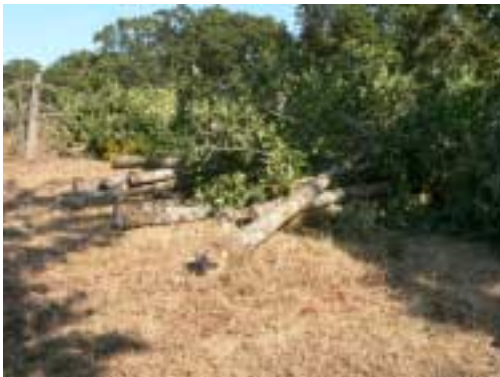
Unit 2 – Firewood size wood laid in windrows