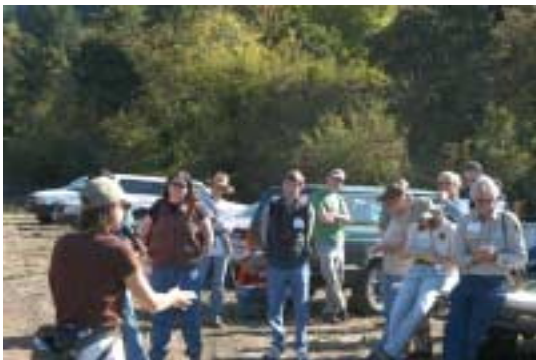
2006 - Project leader presenting background information