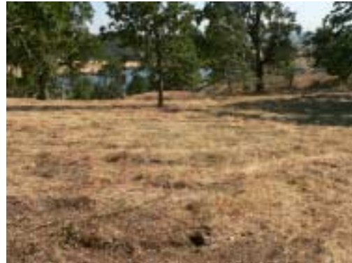
Unit 2 – same area as photo to left after 2006 work (savanna density returned)