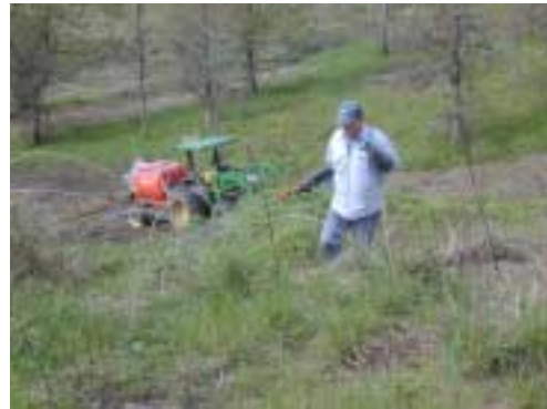
Unit 1 – spray gun application of glyphosate in steep areas summer 2005