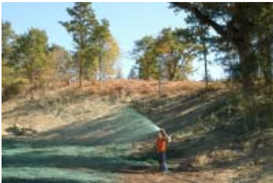
Unit 2 – Heritage employee hydroseeding steep ravine