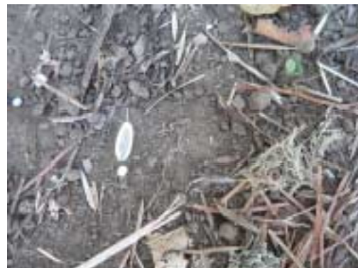
Lomatium nudicaule and Elymus glaucus seed