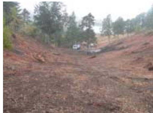
Unit 2 – Steep ravine denuded of most trees and disturbed by machinery and yarding