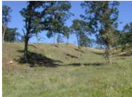
Unit 2 – Young skinny oak steep area thinned by hand 2004