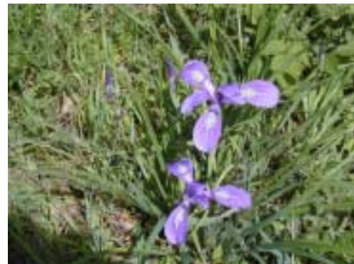
Iris tenax (Oregon iris)