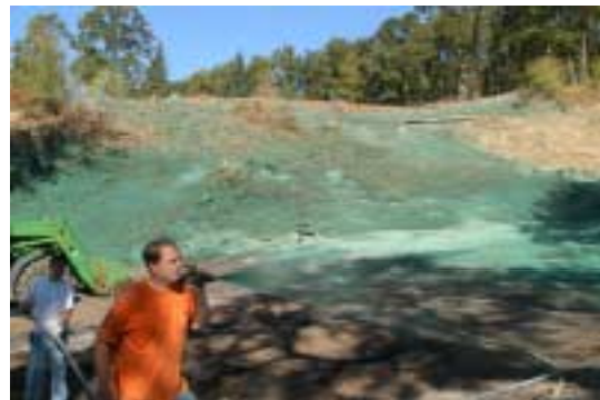
2006 – “Restoration in action” portion of tour