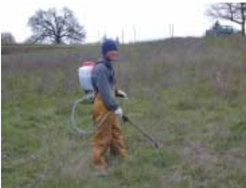
Spot spraying thistles (Note – different restoration site, same technique: cone tip on sprayer and broadleaf herbicide with chemical dye)