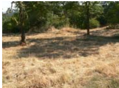
Unit 2 – same area as photo to left, post-mowing