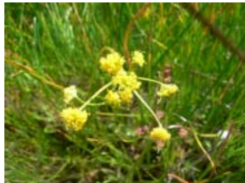
Lomatium bradshawii (Bradshaw's lomatium)