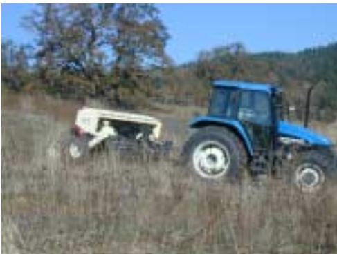
UFSW Truax no-till drill on Unit 1