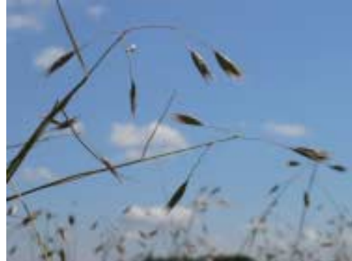
Danthonia californica (California oatgrass) - Collected seed from Jefferson population and sowed production seed on Unit 1