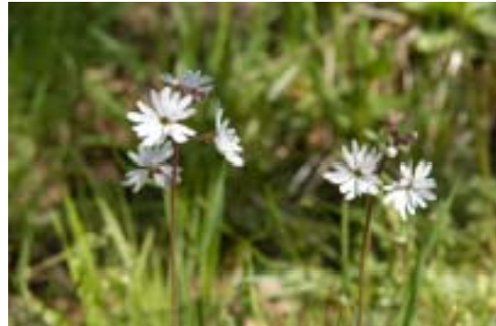
Lithophragma parviflora (Prairie star)