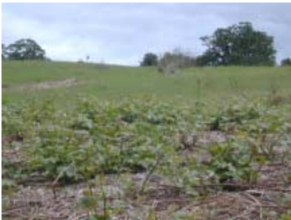
Unit 1 – Blackberry, summer after 1 mowing and first application glyphosate