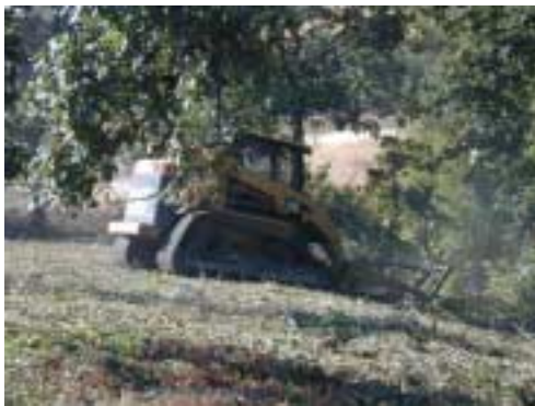
Unit 1 CAT mowing brush