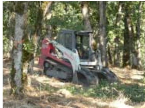
Unit 5 – Takeuchi mowing woodland understory