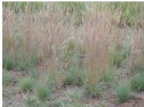
Koeleria macrantha (Prairie junegrass) - Native grass sown in Unit 1