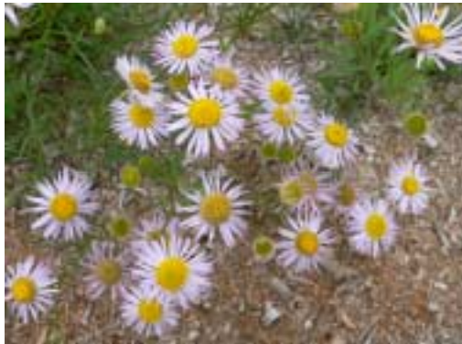
Erigeron decumbens (Willamette daisy)