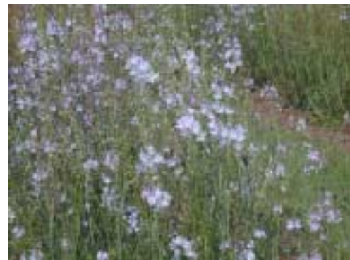
Sidalcea campestris (Meadow Sidalcea)