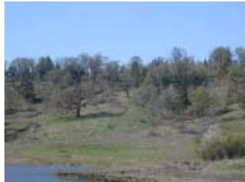
Unit 2 – post thinning 2004