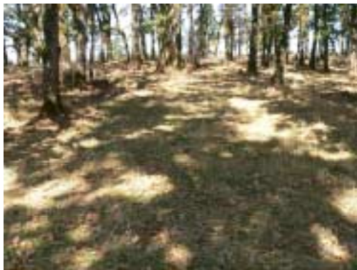
Unit 5 – post mowing and thinning