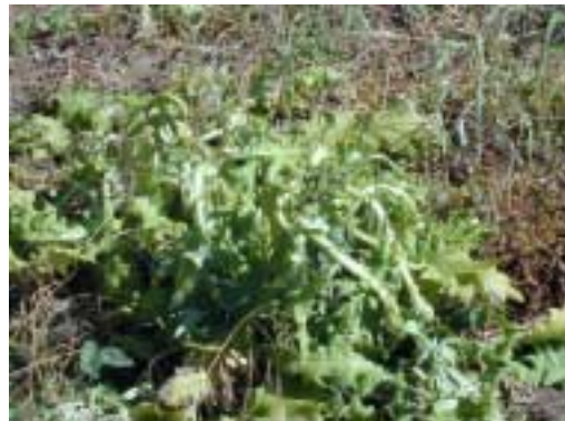
Canadian thistle 3 days after spraying