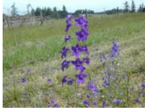
Delphinium oregonum (Willamette Valley larkspur)