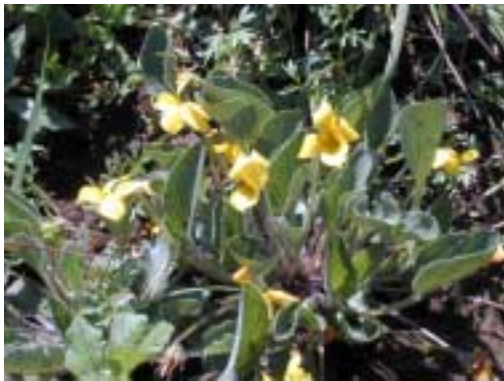
Viola adunca (Prairie violet)