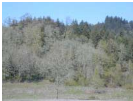
Unit 4 – pre-thinning