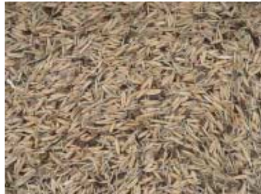
Grass, forb, and oat seed mix for hydroseeding