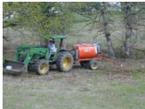
Unit 1 – Boom application of glyphosate summer 2005