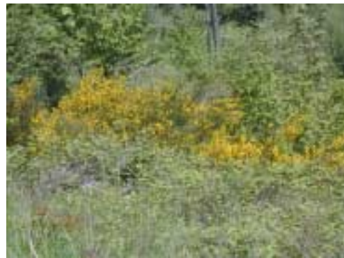
Unit 2 old-growth Scotch broom and blackberry