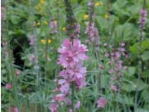
Sidalcea nelsoniana (Nelson's checkermallow)