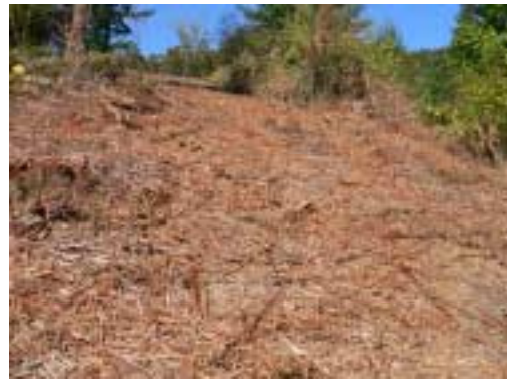
Unit 2 – Blackberry post-mowing