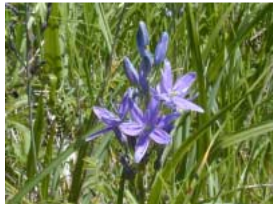
Camassia leichtlinii (Tall camas) - Collected seed from Jefferson remnant population