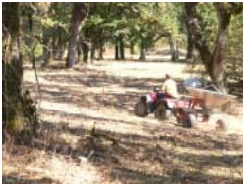
Unit 2 – Heritage employee applying seed with a spinner spreader behind an ATV