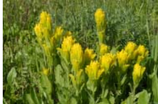
Castilleja levisecta (Golden paintbrush)