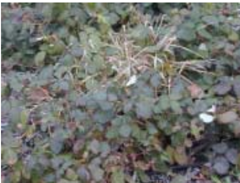
Unit 1 – Blackberry dying after glyphosate treatment