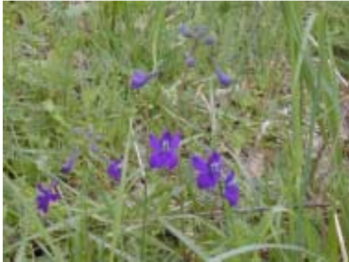
Delphinium menziesii (Menzie's larkspur)