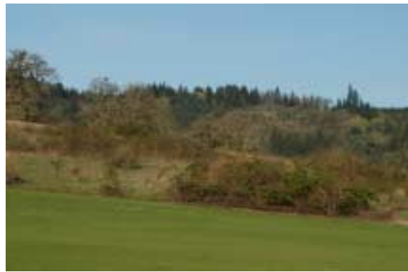
Unit 2 dense brush