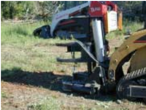
CAT Sheer attachment with herbicide applicator (Takeuchi in background)