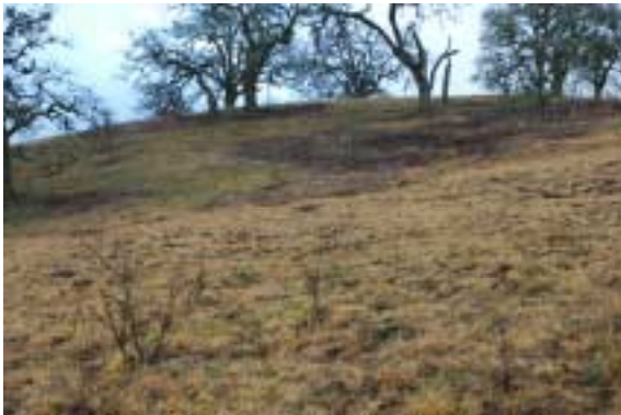
Unit 1 – Late-winter after first application of glyphosate