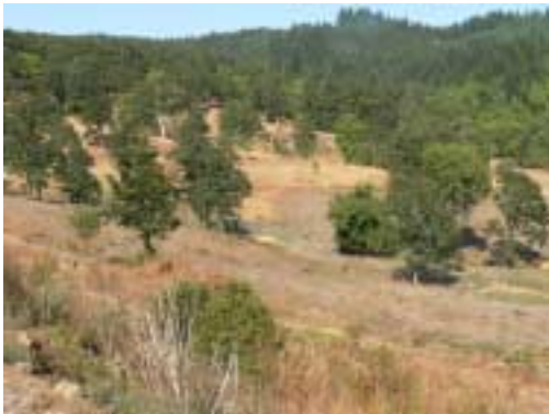
Unit 2 – post thinning 2004 and 2006