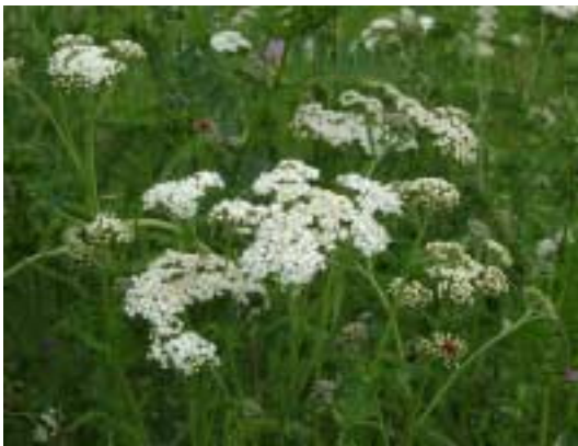
Achillea millefolium (Western yarrow) - Collected seed from Jefferson remnant population