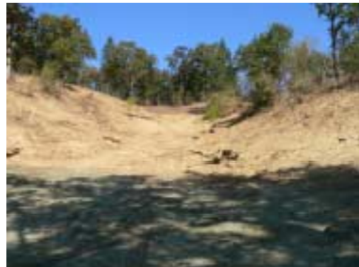
Unit 2 – Ravine, post-hydroseeding (goes from green to brown)