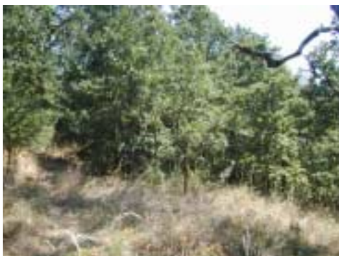
Unit 2 – dense young oak pre-thin