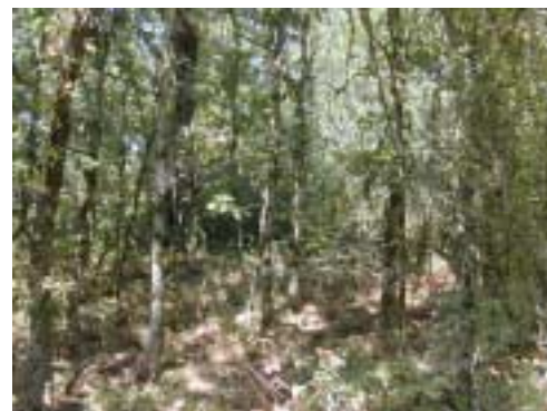
Unit 2 – dense young oak pre-thin (note how shady)