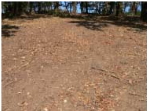
Unit 2 (just below Unit 5) – Ground disturbance due to machinery and yarding material