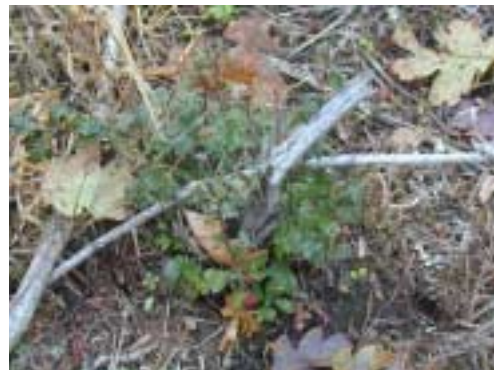
Unit 1 – Hawthorn stump resprouts (only mowed, not cut and stump sprayed)