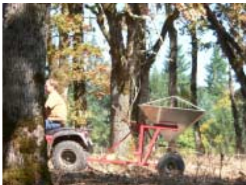
Unit 5 – Applying seed on areas disturbed by logging and mowing