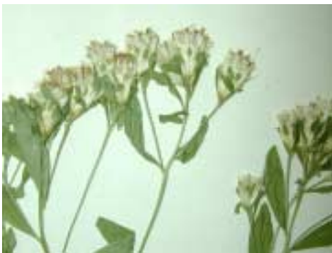
Aster (Seriocarpis) oregonensis (Oregon white-topped aster)