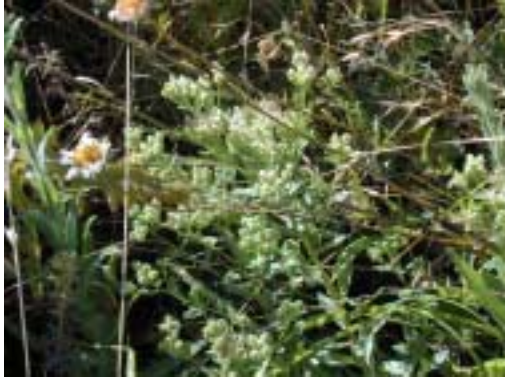
Symphiotrichum (Aster) curtus (White-topped aster)