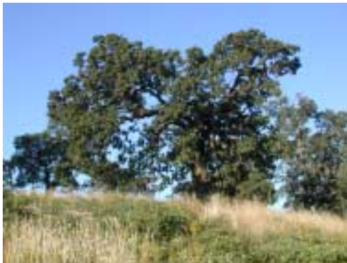
Unit 1 pre-treatment