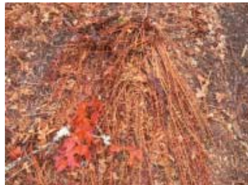
Unit 2 – Ravine previously so shady, supported ferns (non-savanna plant)