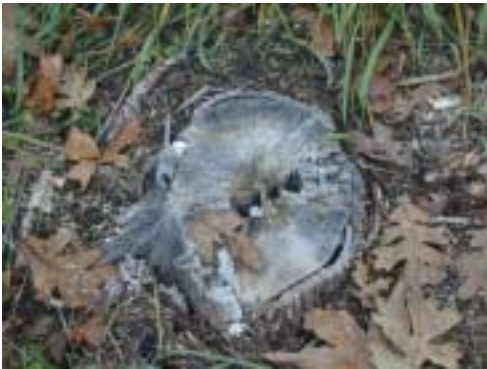
Young oak stump previously treated with stump killer while sheering (no resprouting)