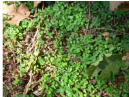
Unit 5 – New Geranium lucidum plants germinated