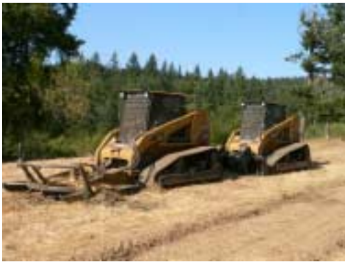
CAT 277 Skid-steers with mower attachment