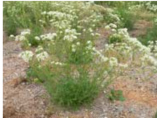
Horkelia congesta (Shaggy horkelia)