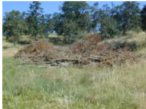
Unit 2 – brush piles