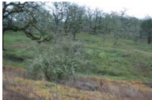
Unit 1 and 2 – Herbicide treated Unit 1 vs. no treatment Unit 2 (green)