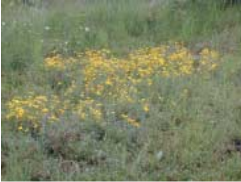
Eriophyllum lanatum (Oregon sunshine) - Collected seed from Jefferson population