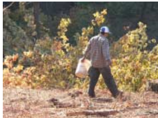
Unit 2 – Heritage employee hand broadcasting grass seed mulch in mowed blackberry area