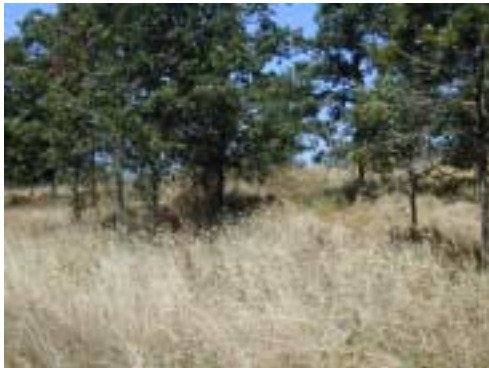
Unit 2 – pre-thin 2006 (young oaks were left in 2004 for potential removal with tree spade)