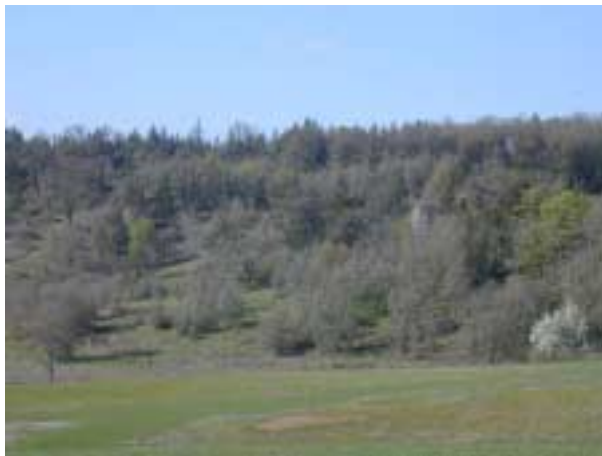
Unit 2 – pre-thinning 2004