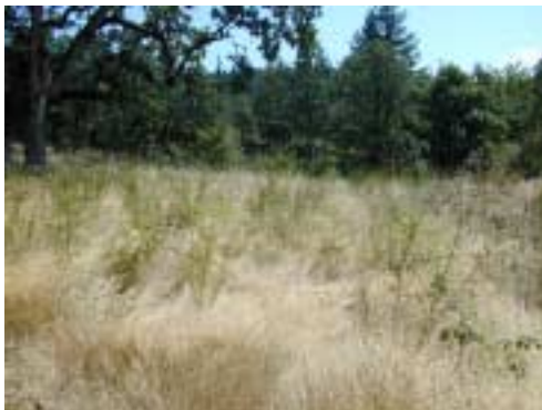
Unit 2 two year old Scotch broom