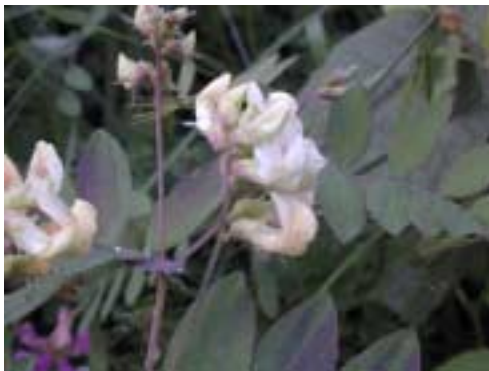
Lathyrus holochlorus (thin-leaved peavine)