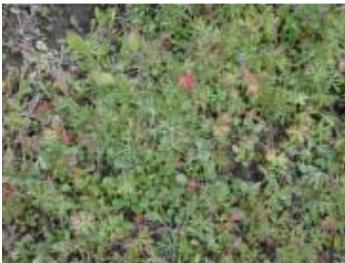
Unit 1 – broadleaf weed infestation after 1 year of glyphosate