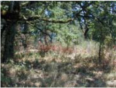
Unit 5 – Very dense thickets of hawthorn, poison oak, and young oak