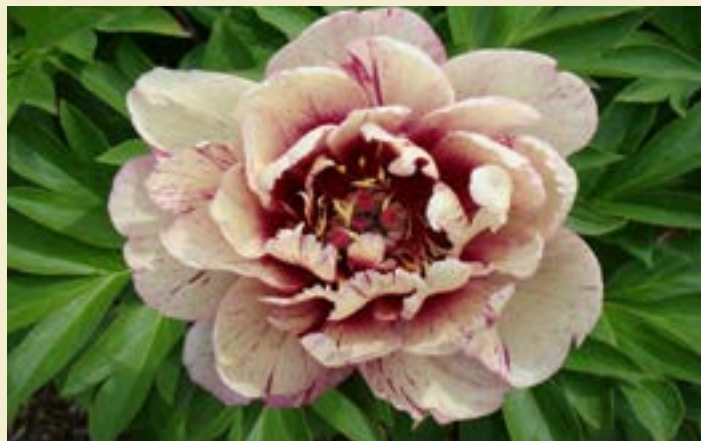
'All that Jazz'™ Garden Candy® Itoh Peony