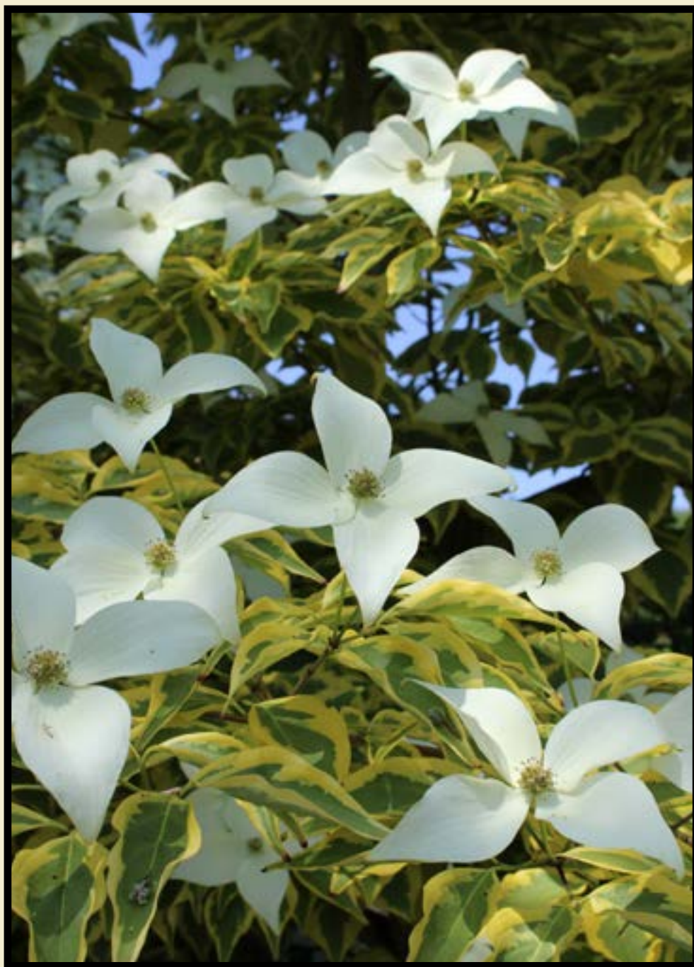
Cornus kousa 'Summer Gold' PP 22,765