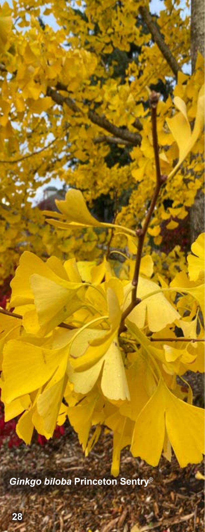
Ginkgo biloba Princeton Sentry®