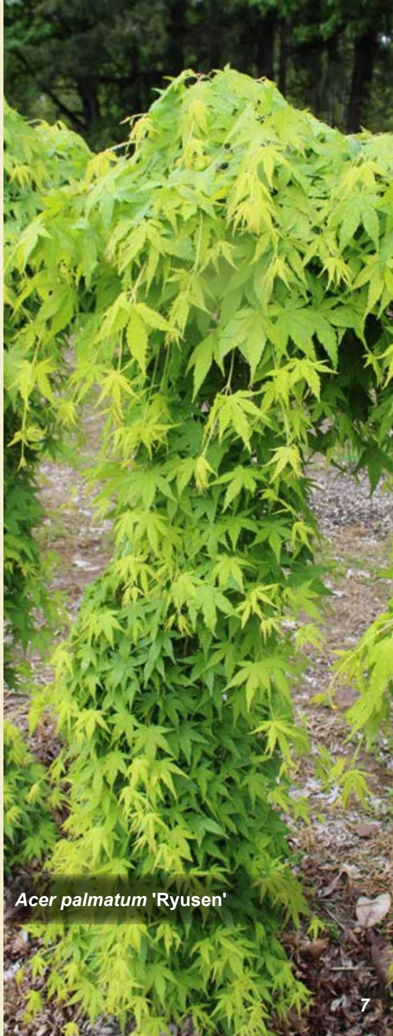
Acer palmatum 'Ryusen'

recognizes trees, shrubs and woody vines of outstanding merit for their superb eye-appeal, performance, and hardiness in Zones 5-7.