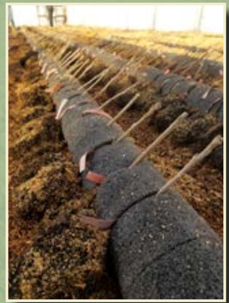
Hot callus set up allows quick heal