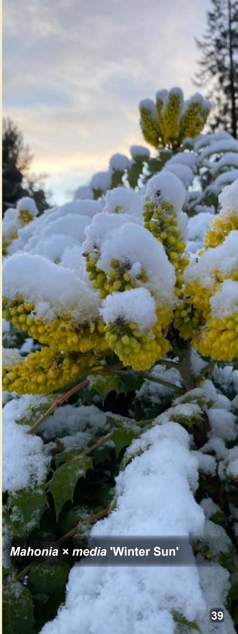
Mahonia × media 'Winter Sun'

Re-pot into Zones 5-9 #1 3-4' #5 $19.75 (10)+