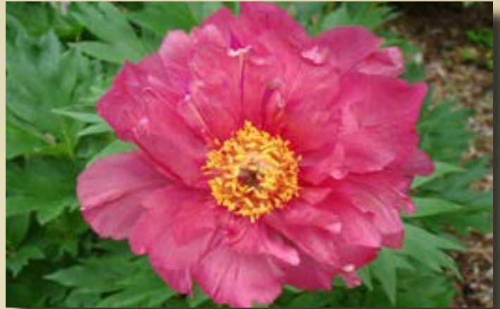
Paeonia Garden Candy® 'Smithopus14' Hot Tamale™ PPAF