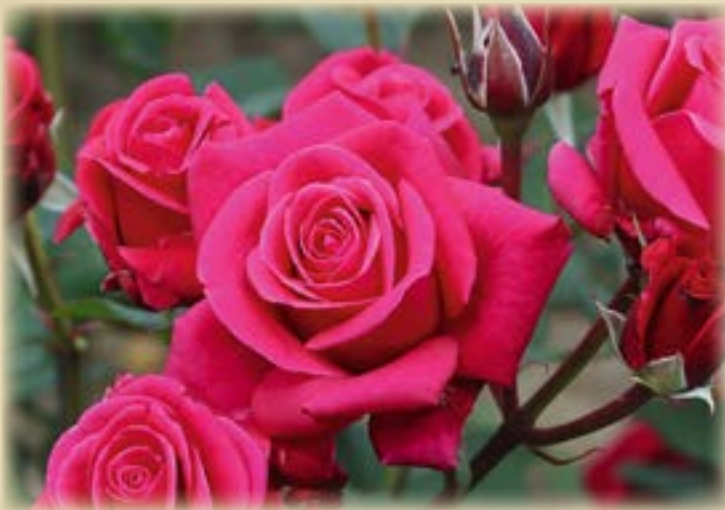
Showpiece™ 'Noa16079' Lipstick