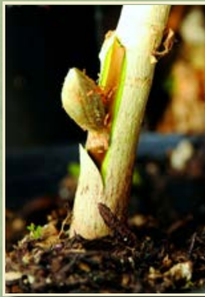
30+ years of chip budding experience