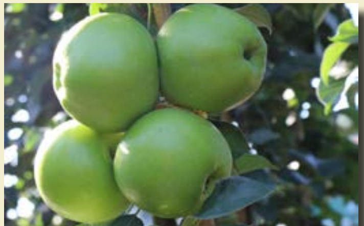
Tangy Green™ 'GreenCats'