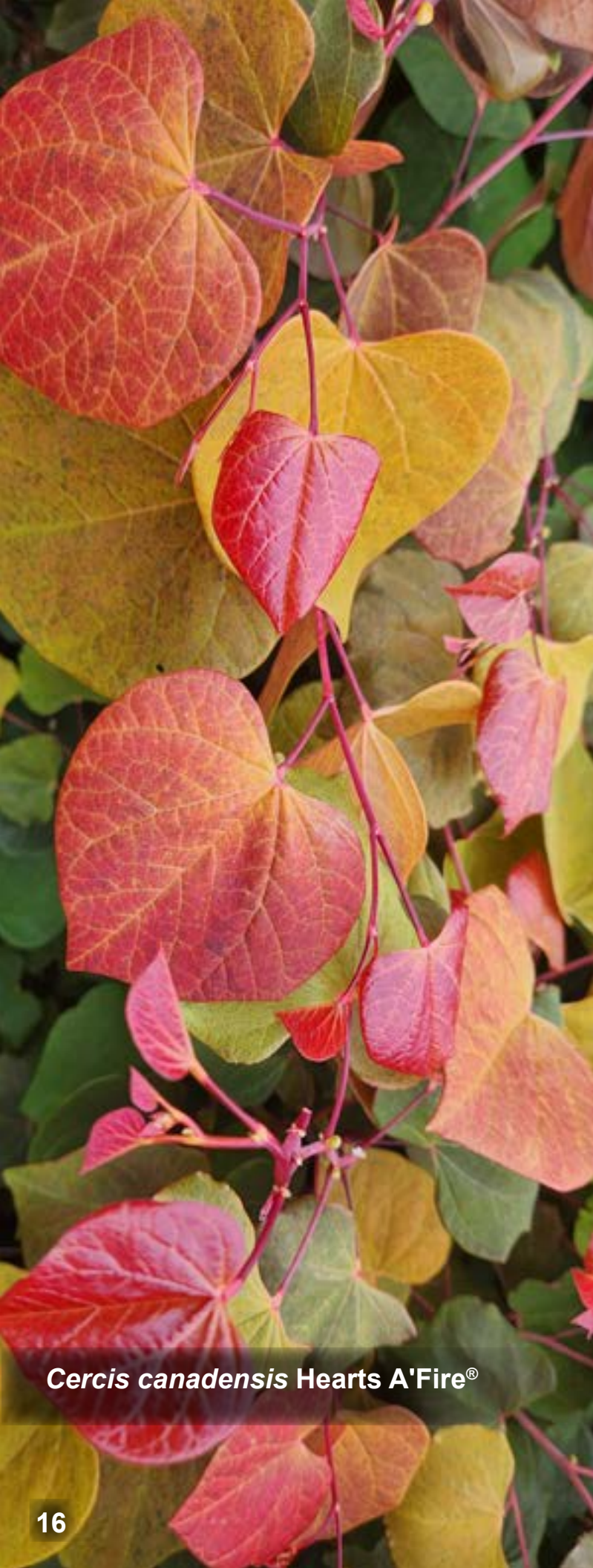
Cercis canadensis Hearts A'Fire®