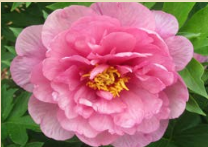
Strawberry Swirl™ Garden Candy® 'Smithopus9' Itoh Peony