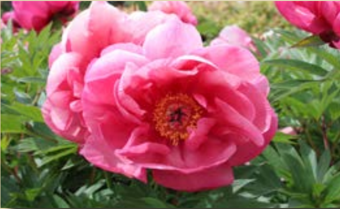
Double Bubble Pink™ Garden Candy® 'Smithopus3' Itoh Peony