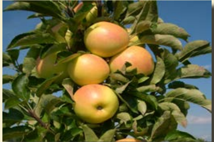
Golden Treat™ 'UEB 41811' PP 30,864