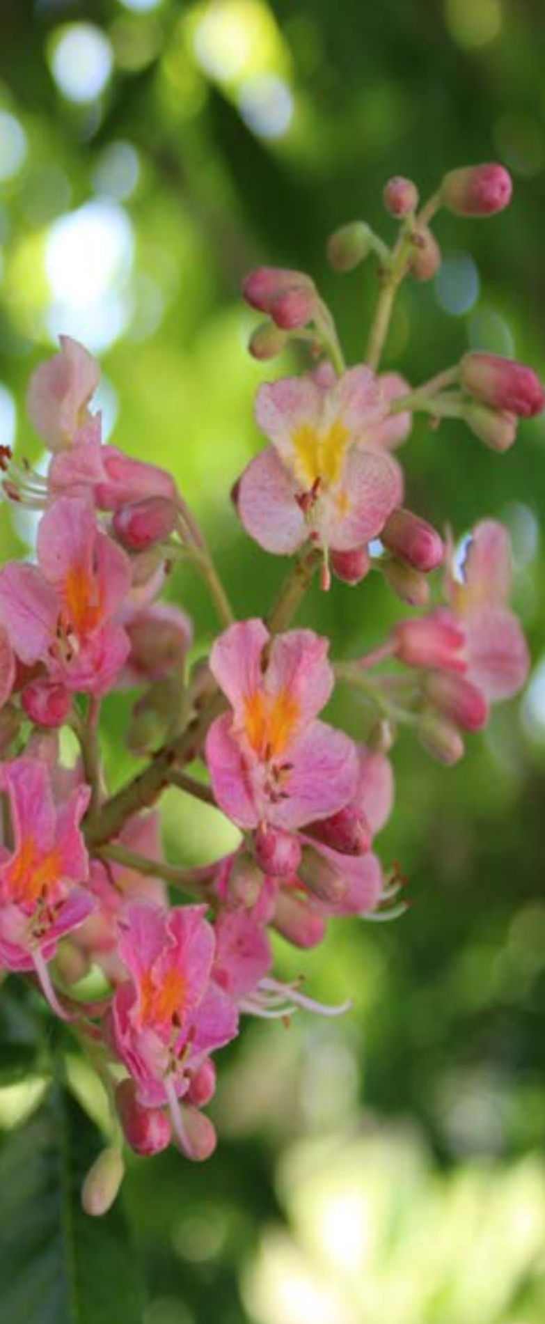
Aesculus x carnea 'Fort McNair'

A hybrid of Aesculus hippocastanum and Aesculus pavia with intermediate characteristics. Best used in a broad, open landscape so it doesn't become crowded. Flowers are an attractive pink, splashed with yellow inside. Generally no fruits are produced, a big maintenance plus.