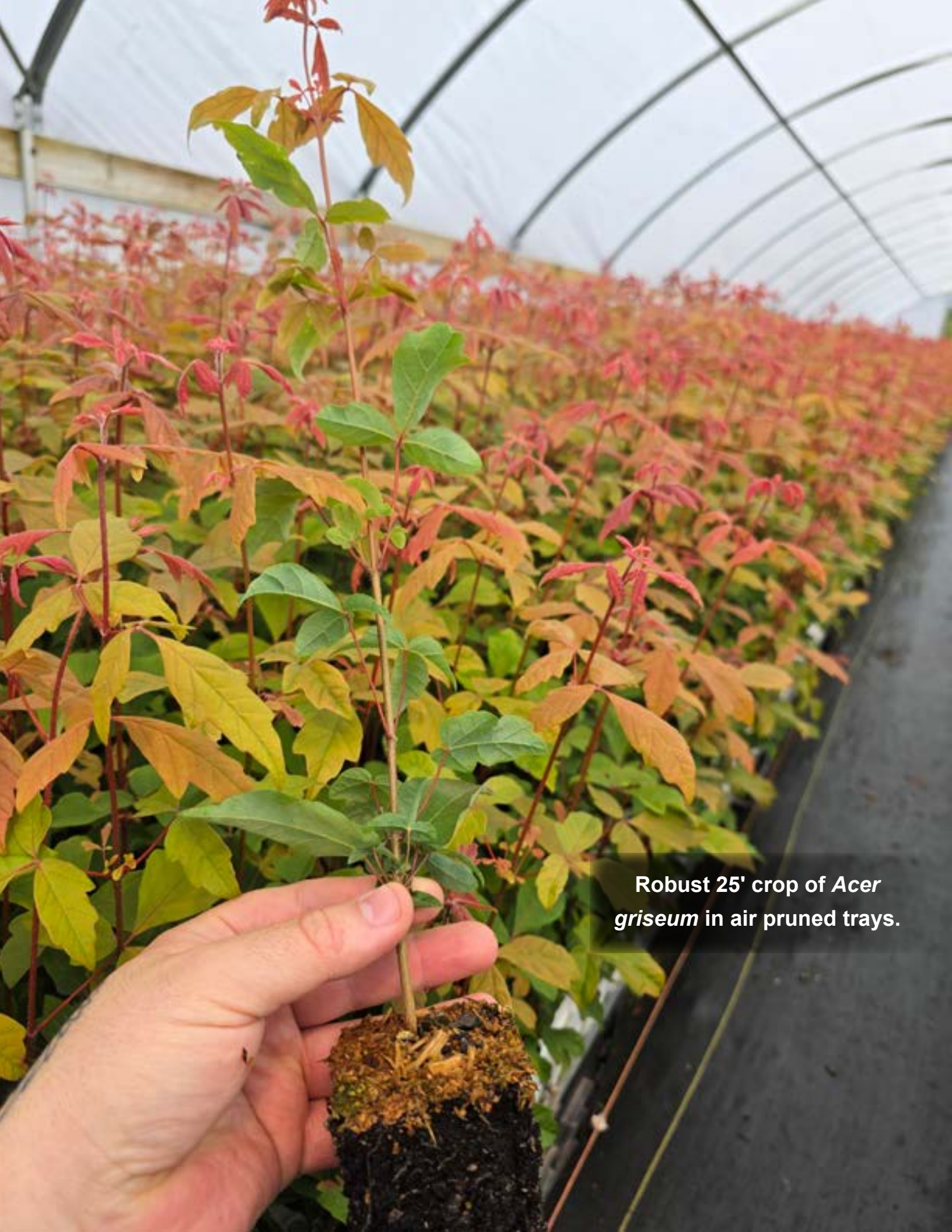
Robust 25' crop of Acer griseum in air pruned trays.