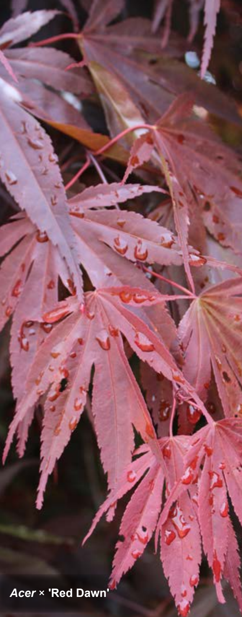
Acer × 'Red Dawn'