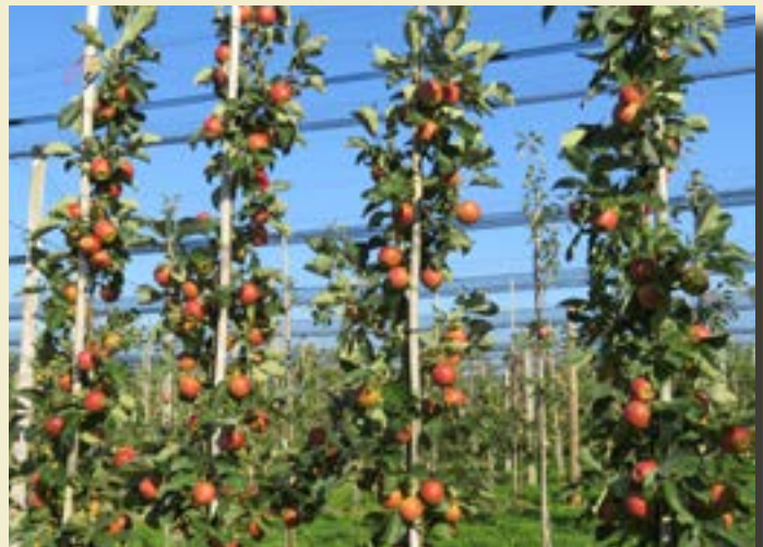
Sweet Treat™ 'UEB 4848/4' PPAF