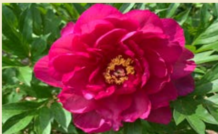
Candy Apple™ Garden Candy® 'Smithpus10' Itoh Peony

Our availability lists are emailed and posted on our website beginning mid August. Look for them monthly after mid-November.