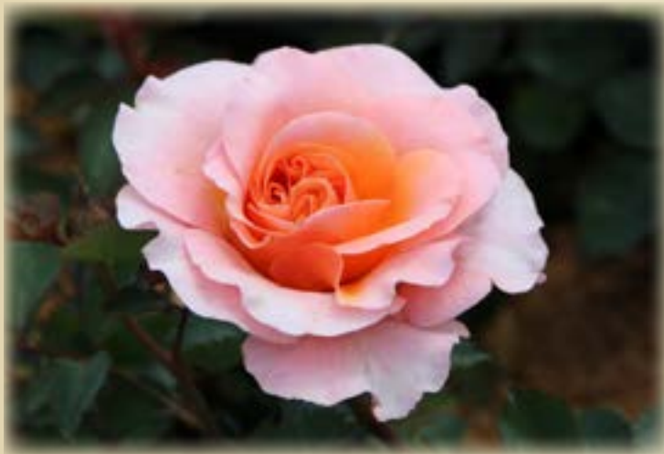
Showpiece™ 'Noa39131' Orange