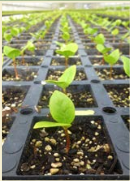
Air pruned seedling plugs