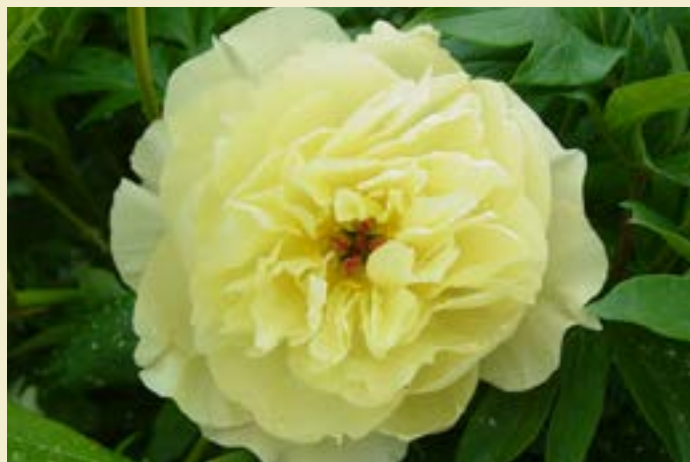
'Amy Jo' Garden Candy® Itoh Peony