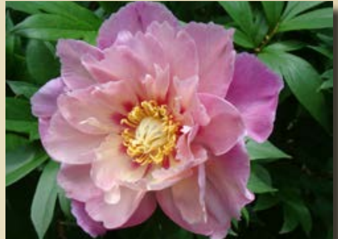
Sweet Treat™ Garden Candy® 'Smithopus13' Itoh Peony