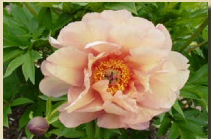
Summer Sunset™ Garden Candy® 'Smithopus9' Itoh Peony

Most of the #1 grown plants will blossom in the spring. All the #2 grown plants will flower in the spring.