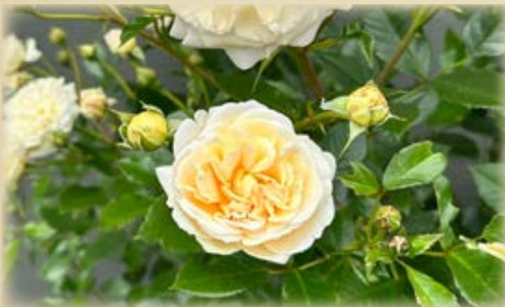
Showpiece™ 'Noa1112130' Champagne