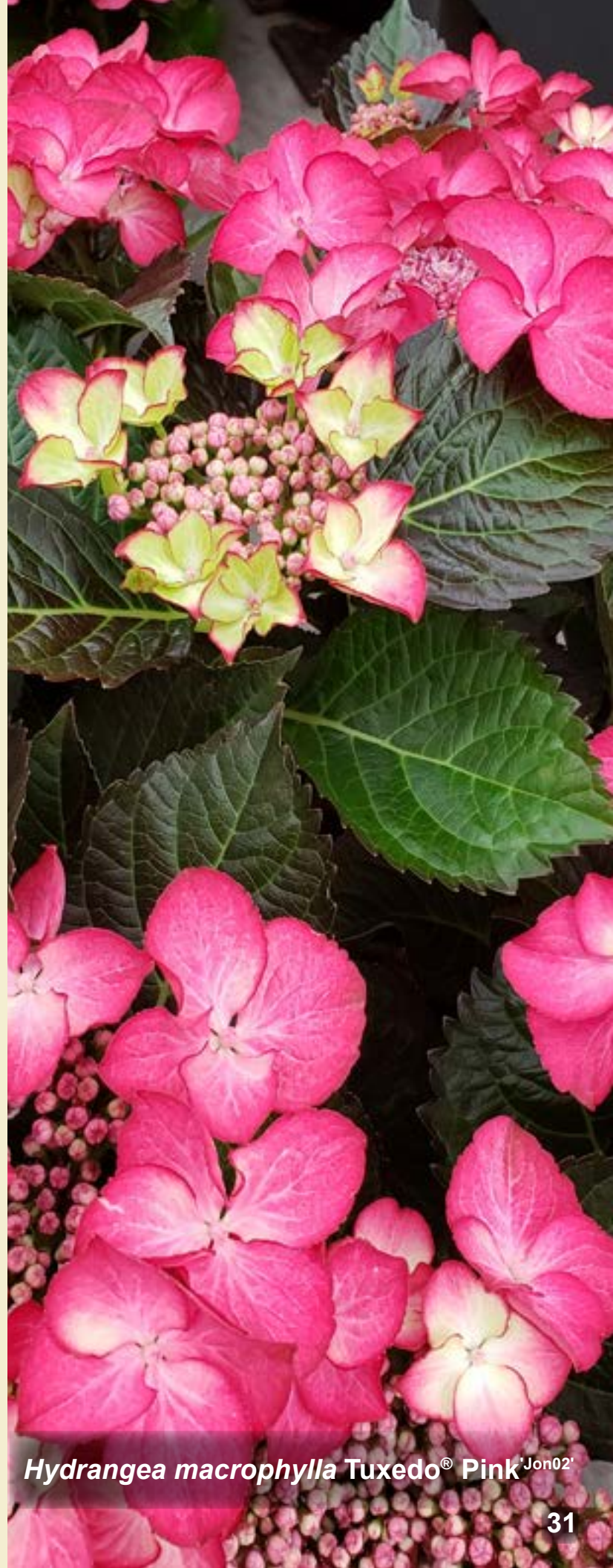
Hydrangea macrophylla Tuxedo® Pink 'Jon02'