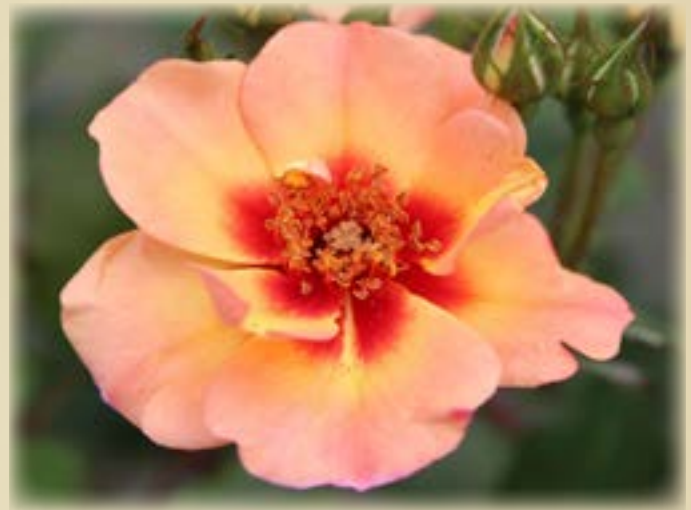
Flower Carpet® Groundcover 'NOA813219' Peach