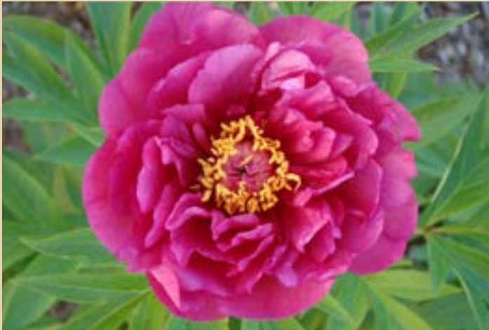
Evie Jane™ Garden Candy® 'Smithopus7' Itoh Peony