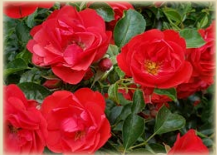
Flower Carpet® Groundcover 'Noa20059' Mini Cherry