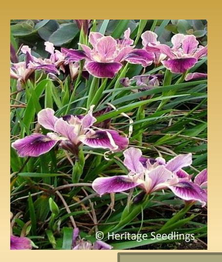
Iris Californian hybrids

Flowers are a rich palette of orange, pink, yellow and purple. Exceptionally vigorous, you can plant them in almost any low landscape border and generally forget them until they astonish you in bloom. Tolerant of dry or seasonally wet soil, they are simply delightful garden plants, and not a single one the same as the others. Inexpensive and fast to finish.